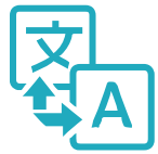
Language Assessment Tools